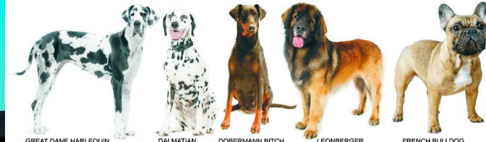
GREAT DANE HARLEQUIN